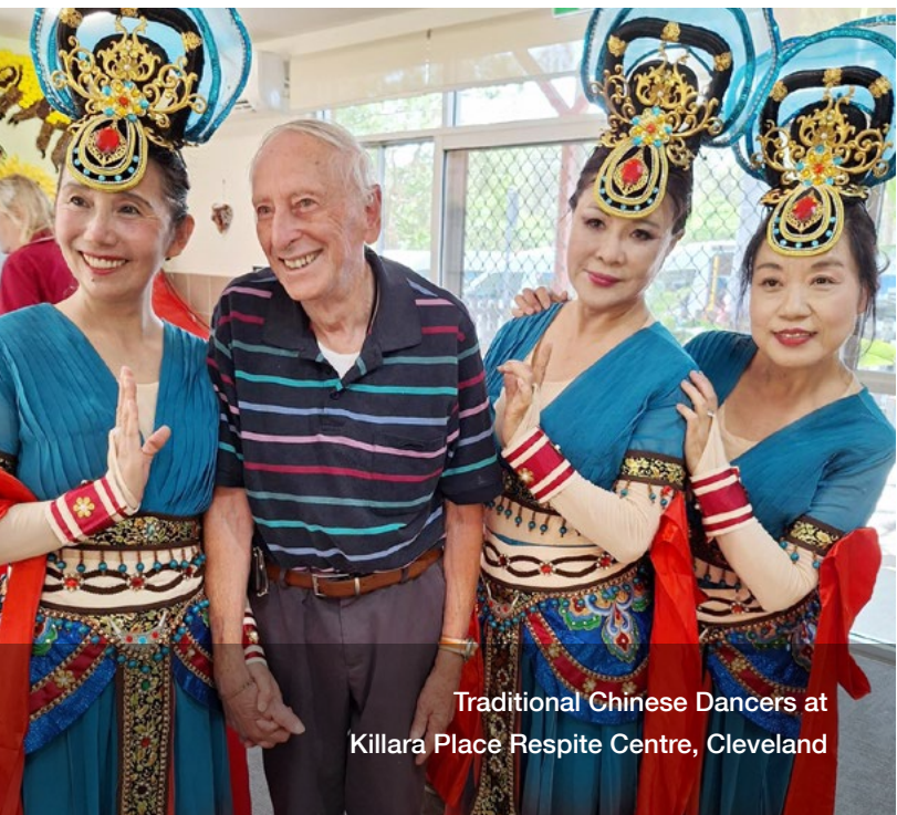
Traditional Chinese Dancers at Killara Place Respite Centre, Cleveland

We are now considering the learnings from this program and developing a plan to attract and support greater numbers of people with a disability across our workforce.