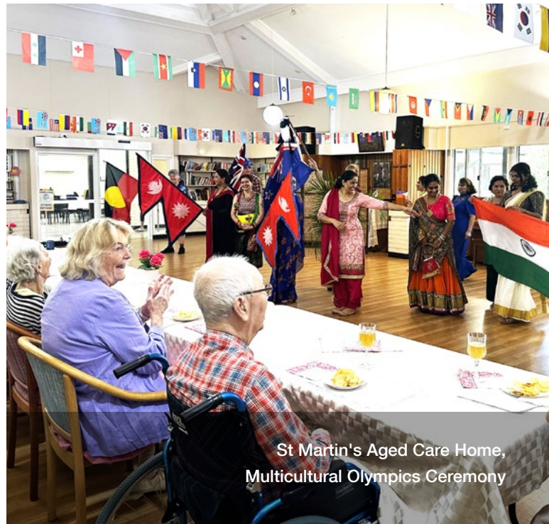
St Martin's Aged Care Home, Multicultural Olympics Ceremony