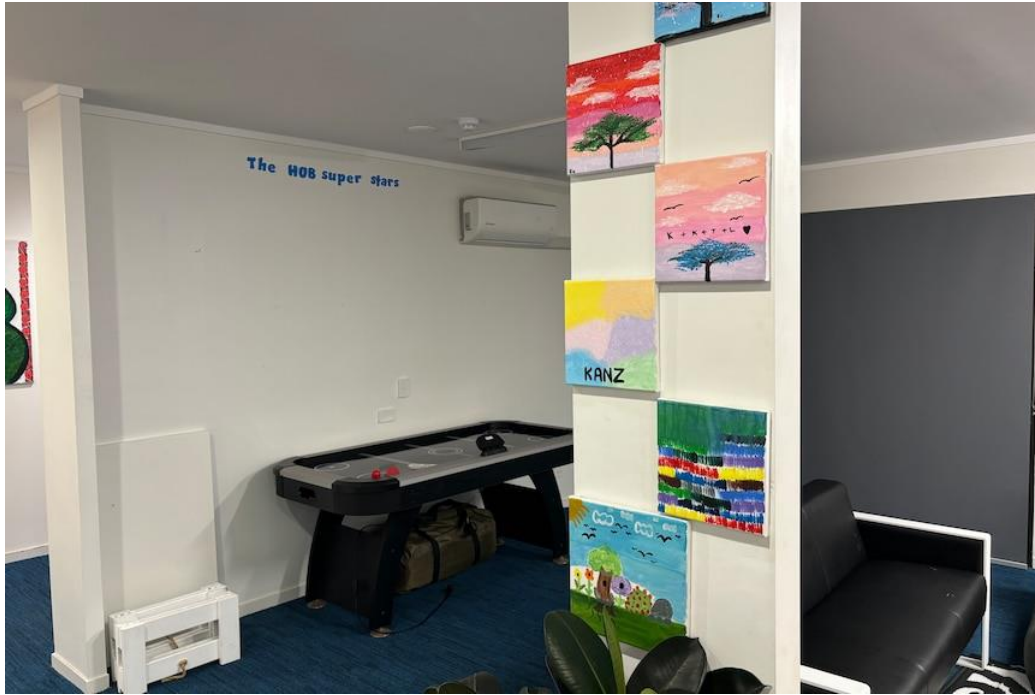
Figure 2: The Southport Hub was a safe place for the basic needs of young people to be met, such as food, showers, clothing, and someone to 'have a yarn with'